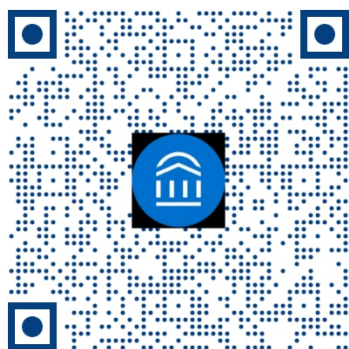
Navigate App - Android