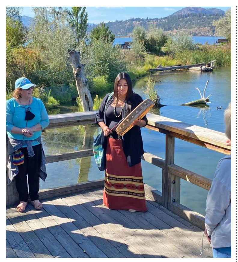
9 Days • 13 Meals: 8 Breakfasts, 2 Lunches, 3 Dinners

HIGHLIGHTS... Calgary, Albertan BBQ, Banff, Bow Falls, Lake Louise, Revelstoke Railway Museum, Okanagan Valley, Choice on Tour: Indigenous Traditions and Ancestral Lands Tour or Hidden History of Downtown Kelowna Tour, Vineyard Dinner and Wine Tasting, Vancouver, Stanley Park, Granville Island